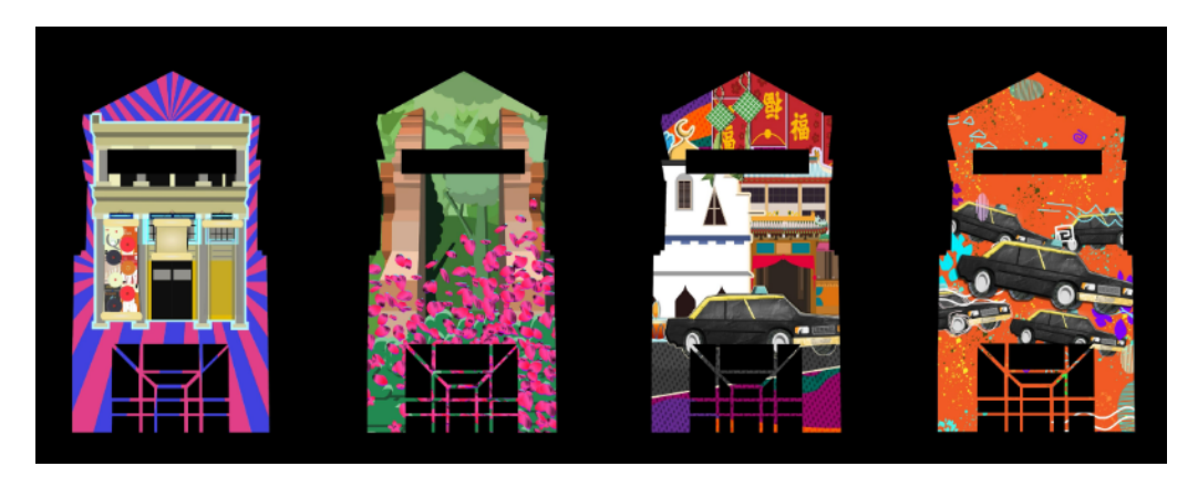
Artists' impression of Madeleine, courtesy of Lueur

SNF's popular projection mapping installations return with six works illuminating iconic buildings in the city. Rediscover Singapore's mythical origins at the National Museum of Singapore with Stories from Forbidden Hill by Maxin10sity , then head to the National Archives of Singapore for a colourful throwback to the cinema of times past with Midnight Show at the Capitol by MOJOKO , which revisits the classic movie posters that used to adorn the walls of Capitol Theatre and Cathay Picture House.