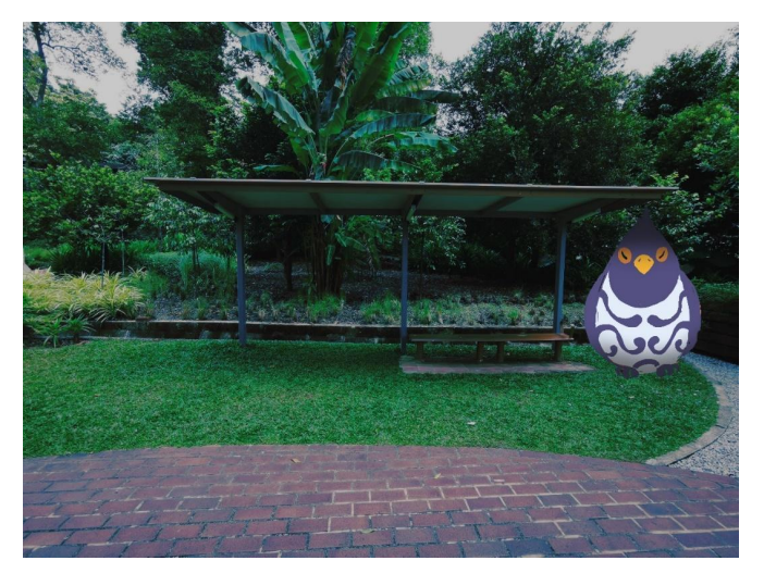
Artist's impression of tobyato bird pitstop

impact of technology on our daily lives. City of Books , a large-scale anamorphic pavement mural by Fish Jaafar , sheds light on the decline of print media.