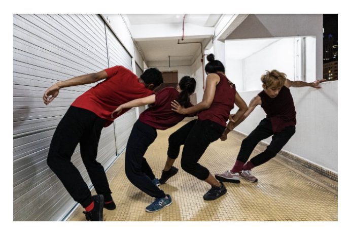
Enactment of Discoloo Centre

Festival-goers can also look forward to an exciting line-up of performances at five different locations across both weekends during the festival, which celebrate the diverse and vibrant performing arts scene in the precinct. Yesterday Once More: Queen Street by Inch Chua and Tim De Cotta will dive deep into the history of the precinct, spotlighting personal stories from past and present inhabitants, including a young mother who previously sold noodles along the street come rain or shine; and Aunty Cecilia, who lived through the Japanese Occupation on Queen Street and still resides there today. Armenian Street Party will feature a special catwalk stage at Armenian Street with BBB's very own artists and arts groups taking the limelight, including Bhaskar's Arts Academy, The A Cappella Society, Traditional Arts Centre Ltd, OM The Arts Centre, and SMU Voix. At Waterloo Centre, P7:1SMA's roving act Discoloo Centre will relive the precinct's past nightlife paired with historical anecdotes of disco fever. Music-lovers can also swing over to Jazz'in @ Capitol Singapore at Capitol Singapore's Outdoor Plaza for smooth jazz tunes from home-grown artists such as Amanda Lee Swingtet and The Rhythmakers.